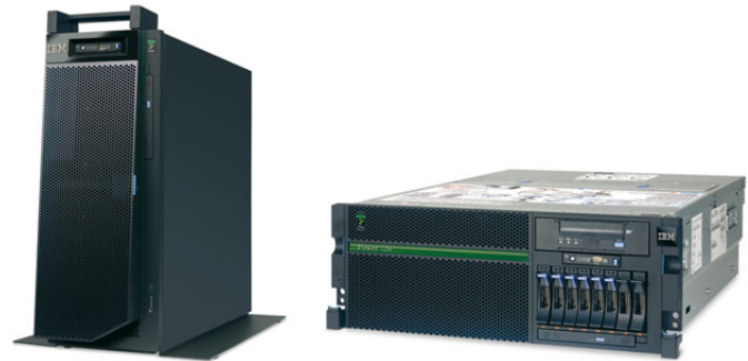
Power 720 Express tower and rack-mount servers

The Power 720 Express is designed with capabilities to deliver leading-edge application availability and allow more work to be processed with less operational disruption. RAS capabilities include recovery from intermittent errors or failover to redundant components, detection and reporting of failures and impending failures, and self-healing hardware that automatically initiates actions to effect error correction, repair or component replacement. In addition, the Processor